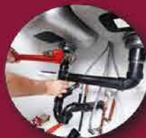
PLUMBING & DRAINAGE