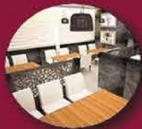
CIVIL & INTERIOR