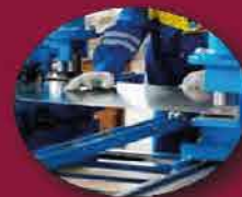
METAL SHEET FABRICATION